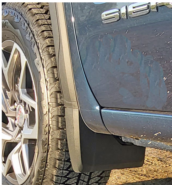
Narrow front Splashguard